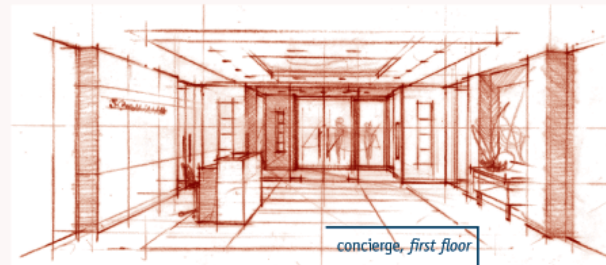
concierge, first floor