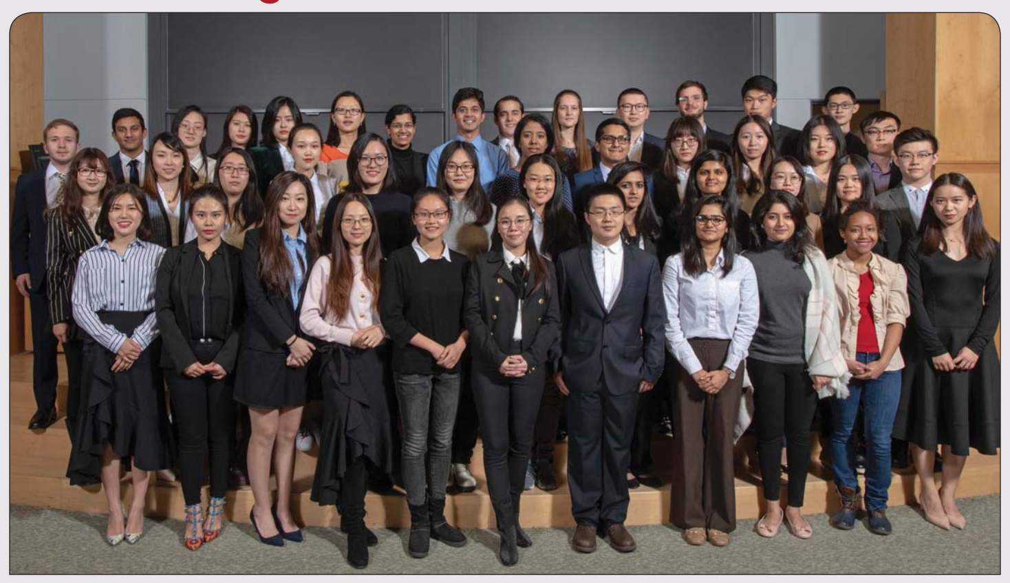
Students of the Master's Program assembled for the photo on April 10, 2018. Baffled by April showers, they retreated indoors to the Photonics Auditorium where these two group photos were taken.